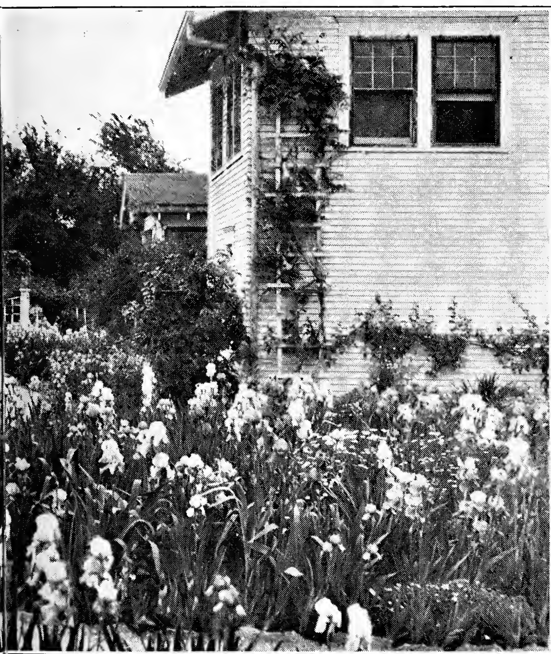
RDENS, SHOWING RUGGED KANSAS GROWN IRIS

MARY WILLIAMSON —A novel and catchy color arrangement. S. milky white; horizontal falls of violet purple with a wide border of pure white. Stunning ruffled flowers on slender 27 in. stems. FRAGRANT. Very effective for cutting. EXTREMELY LATE. 3 for 25c. Each ..... 10c